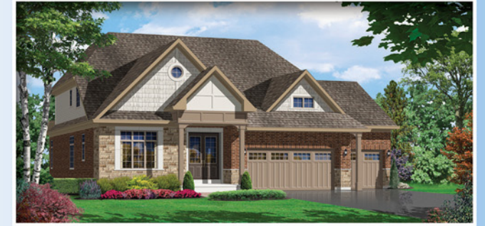
Bungalow Loft Elev-A -2775 sq.ft.