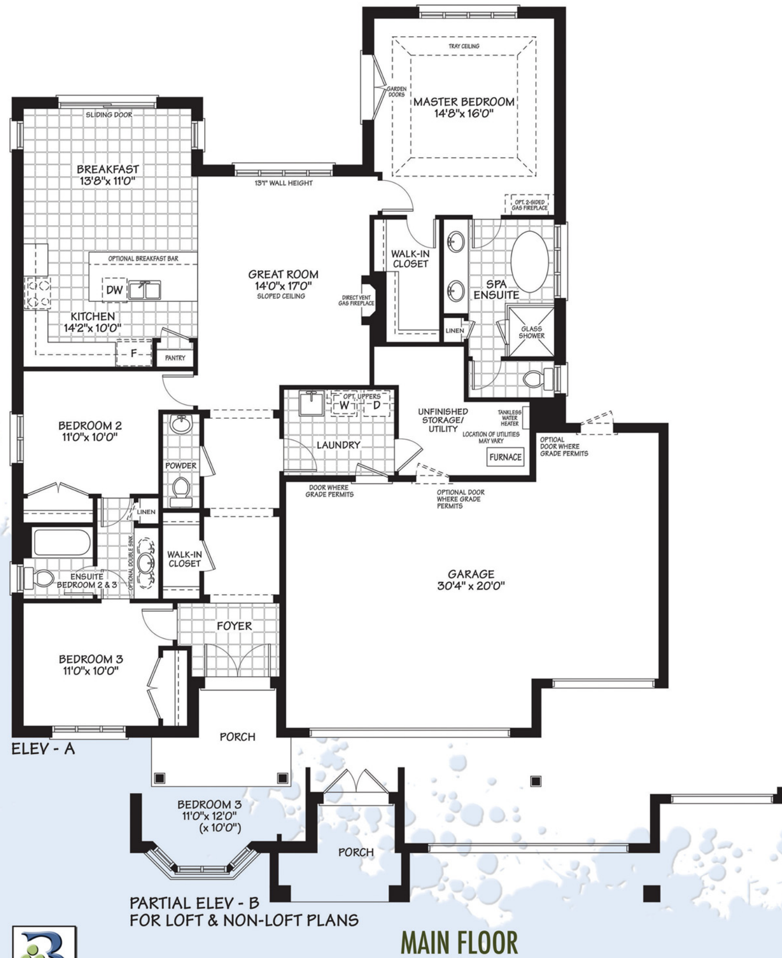
ELEV - A