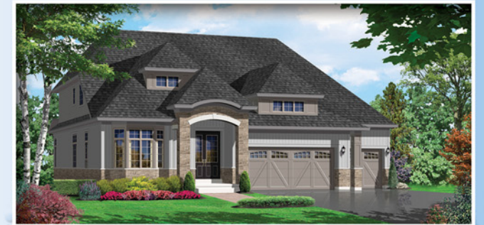
Bungalow Loft Elev-B -2790 sq.ft.